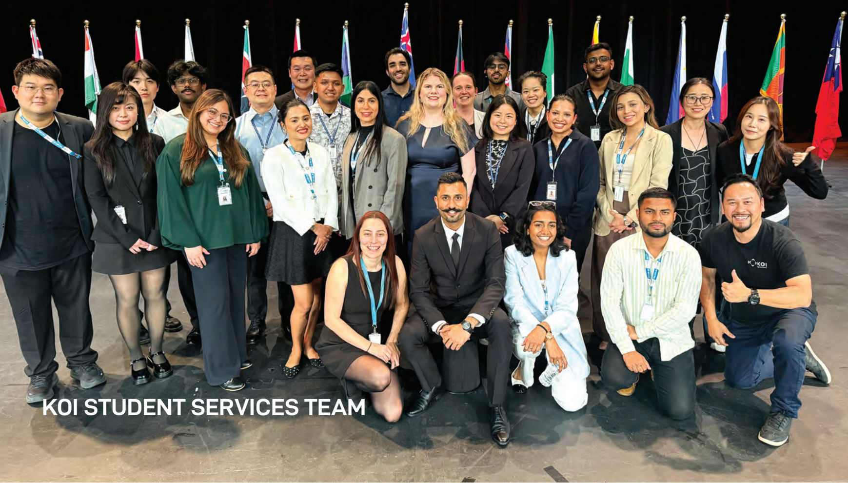
KOI STUDENT SERVICES TEAM